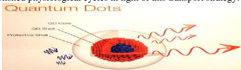
Figure 2: Quantum Dots

repression of charge transporter molecules. Because of its unique, horrifying characteristics in comparison to traditional natural hues, QDs have recently been used as a new generation of fluorophores in bioimaging and biosensing. As a means of producing solar fuel, QDs can also act as photocatalysts in the light-dependent chemical conversion of water into hydrogen. When QDs were used at low focus, there was no discernible cytotoxicity to seed germination or seedling growth. Consequently, QDs can be used for live imaging in plant root foundations to validate established physiological cycles in light of this transport strategy.