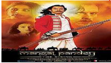
Fig. 1: Mangal Pandey : The Rising