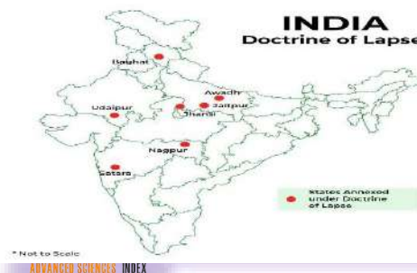
Fig. 2: Doctrine of Lapse

Economic Distress and Inequality: The cumulative impact of these policies and practices was the perpetuation of economic distress and inequality. Local economies were disrupted, traditional livelihoods were undermined, and wealth and resources were concentrated in the hands of the British rulers and a small elite class. This disparity in wealth distribution contributed to social and economic inequality, with the majority of the Indian population struggling to make ends meet.