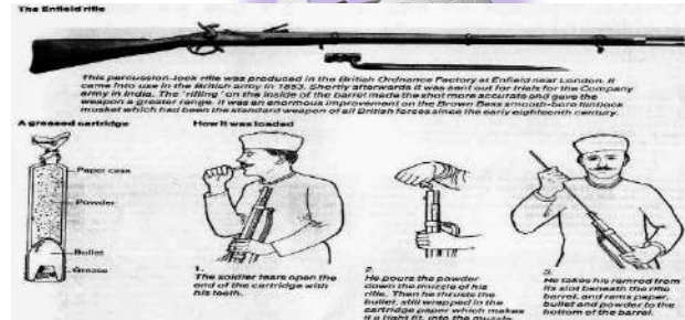
Fig. 3: Cartridge Controversy to Cultural Uprising: Mangal Pandey's Defiance

discontent and resistance of indigenous people against economic exploitation and cultural imposition. Colonial policies such as land revenue settlements, heavy taxation, and zamindari systems often led to agrarian distress and displacement of rural communities. In response, various peasant movements emerged across India. These movements aimed to protect land rights, challenge exploitative practices, and seek better economic conditions. The movements also played a role in fostering a sense of solidarity among different rural communities facing similar challenges. The colonial period saw the emergence of nationalistic movements that sought to address socioeconomic issues and demand self-governance.