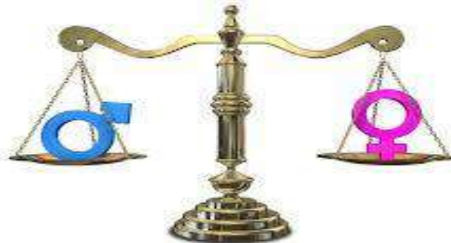
Figure 1: Gender Equality

The idea of equality has undergone significant change throughout human history, influenced by diverse philosophical traditions and socio-political developments. Equality has changed from a crude conception of equal treatment to a more sophisticated view that recognizes the existence of structural inequities.