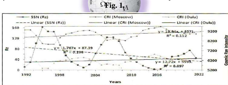
Fig. (1) Has shown the long - term change of state of the sun during period of solar cycle 22 to 24. Its modulate the cosmic rays during the same period of time. We found that cosmic ray intensity during solar cycle 24 have been increased than solar cycles 22 and 23.

cosmic ray flux enters solar system anti-correlated with the solar activity. This anti-correlation is detected at the Earth surface by measurement. The cosmic ray flux varies with solar cycle during the period of solar cycle 22 to 24 (Anath 1975). The unit of cosmic ray intensity is (particle/- ster. sec. MeV). When cosmic rays flux enter solar system these flux modulated by the solar ejecta (Nagashima & morishita 1979; Mavoromichalaki & Petropoulos 1984; Nymmik & Suslov 1995; Storini et al. 1995). The cosmic rays are deflected by the magnetic field in interstellar space, they are also affected by the interplanetary magnetic field embedded in solar wind and therefore have difficulty reaching the inner solar system. As solar activity varies, over the 11 - year solar cycle the intensity of cosmic rays at Earth also varies, in anti-correlation with the sunspot numbers.