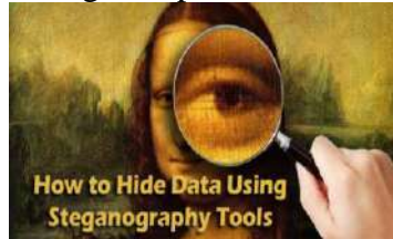
Figure: 1.2- Type of data hiding by cryptography tool

years and attracted concentration from both academic world and industry world. Methods include projected for a assortment of applications including rights security, authentication and precise to exploit organize. Imperceptibility, strength beside reasonable processing for example compression and the competence to conceal several crumbs be indispensable but to a certain extent inconsistency conditions designed for several data thrashing applications [9]. With cryptography, way based on GA offered which protected against RS thrats. This technique in initial step implants secret bits into host image just similar to simple LSB and in second step modifies pixel values to build steno image RS parameters sit in protected region.