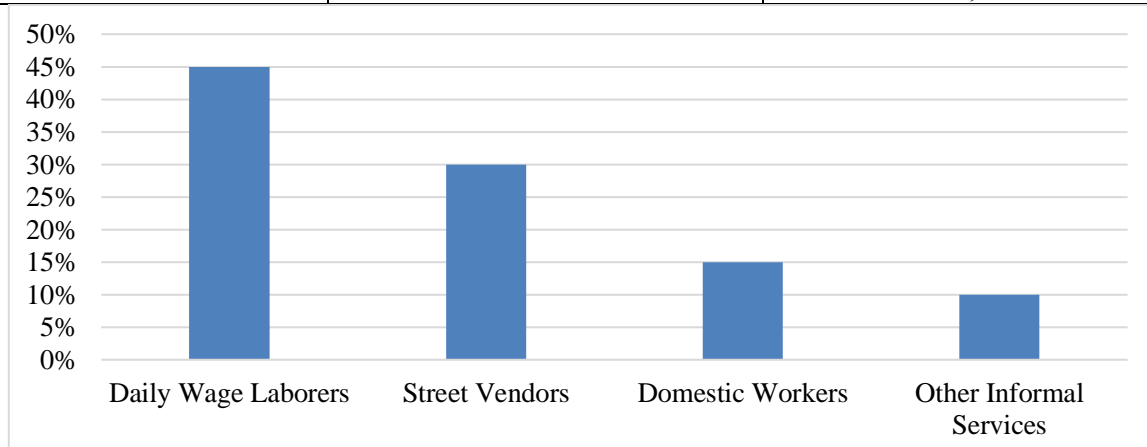
Figure 1: Graphical Representation of Nature of Employment and Income Volatility